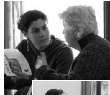
Patch Team members meet at Parks Place on a recent Thursday.

One of the reasons a Patch approach works so well is that it finds ways of meeting the needs of a community in proactive and positive ways. Because Patch Team members are more in-tune with what is happening locally they are more inclined to intervene on issues before they turn into a crisis. Members exchange information, share ideas and coordinate activities—it's a true collaborative effort. It's also a wonderful way to meet and work with a diverse group of people that are enthusiastically approaching issues and trying to address them now, not in the distant future.